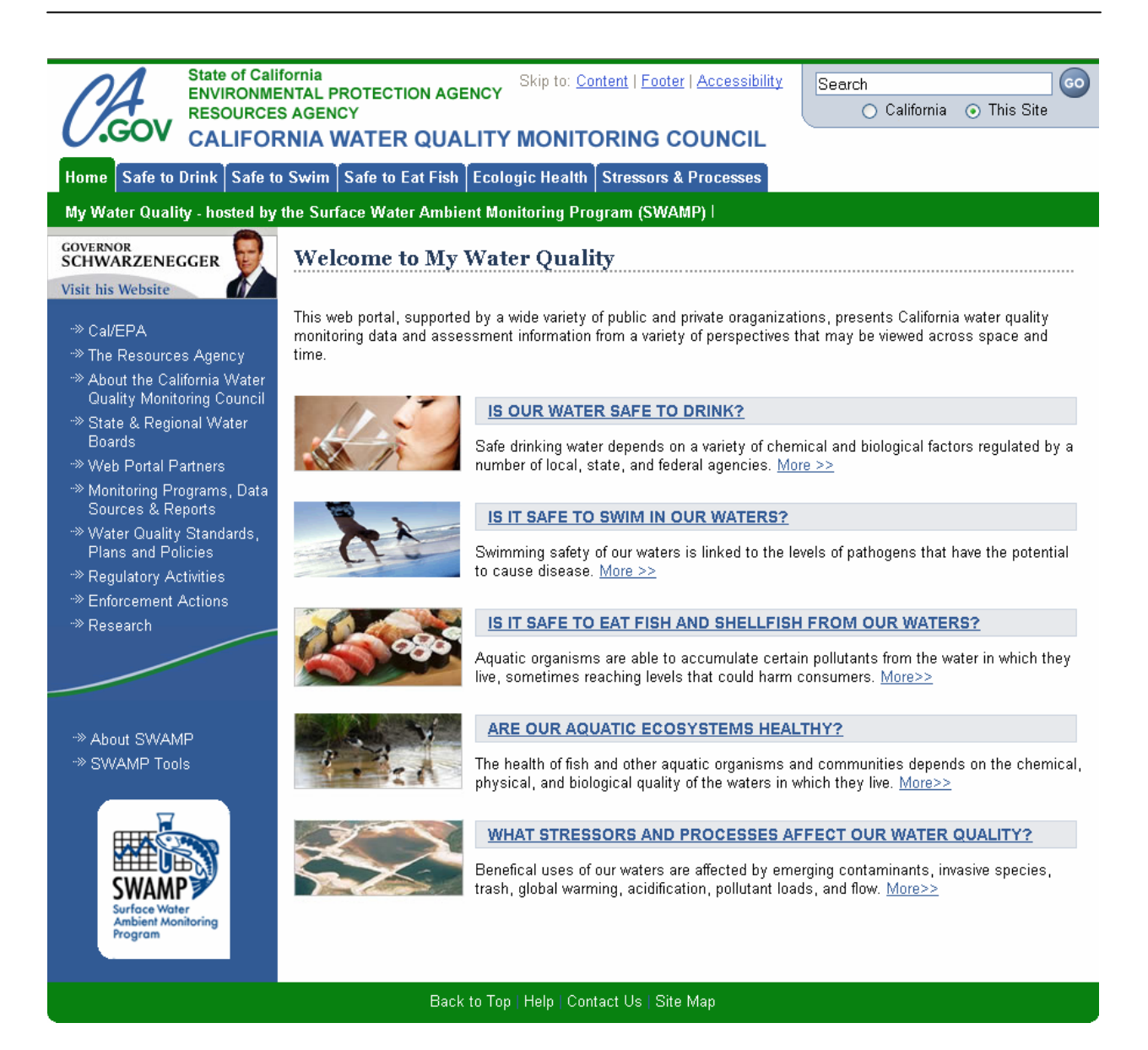
Figure 2. Draft Monitoring Council homepage, designed as a global entry point to monitoring and assessment information for all theme and sub-theme web portals.

Each question will lead to a series of web pages for each theme (see Figure 3 for the draft page for swimming safety) that provide map-based access to summary assessment products and more detailed monitoring data, as well as tools for downloading data and conducting ad hoc queries and analyses. Links along the left-hand side of each page will enable users to access management, regulatory, and technical information specific to each theme. In the draft swimming safety portal (Figure 3), additional pages addressing more detailed questions link to