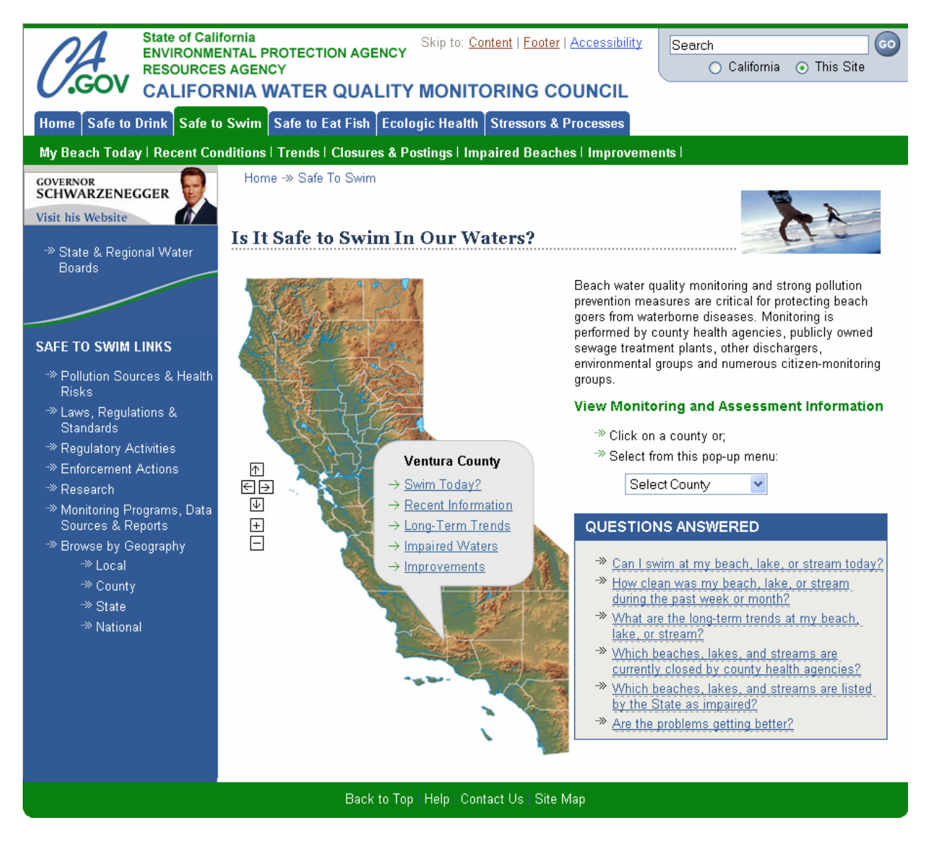
Figure 3. Draft Monitoring Council page for the theme "Is it safe to swim in our waters?"

websites maintained by a variety of entities, including the State Water Board, USEPA, and Heal the Bay. Being connected together through a single portal will provide both incentive and a mechanism for achieving greater standardization among related programs (as described below, Section 2.1.4).