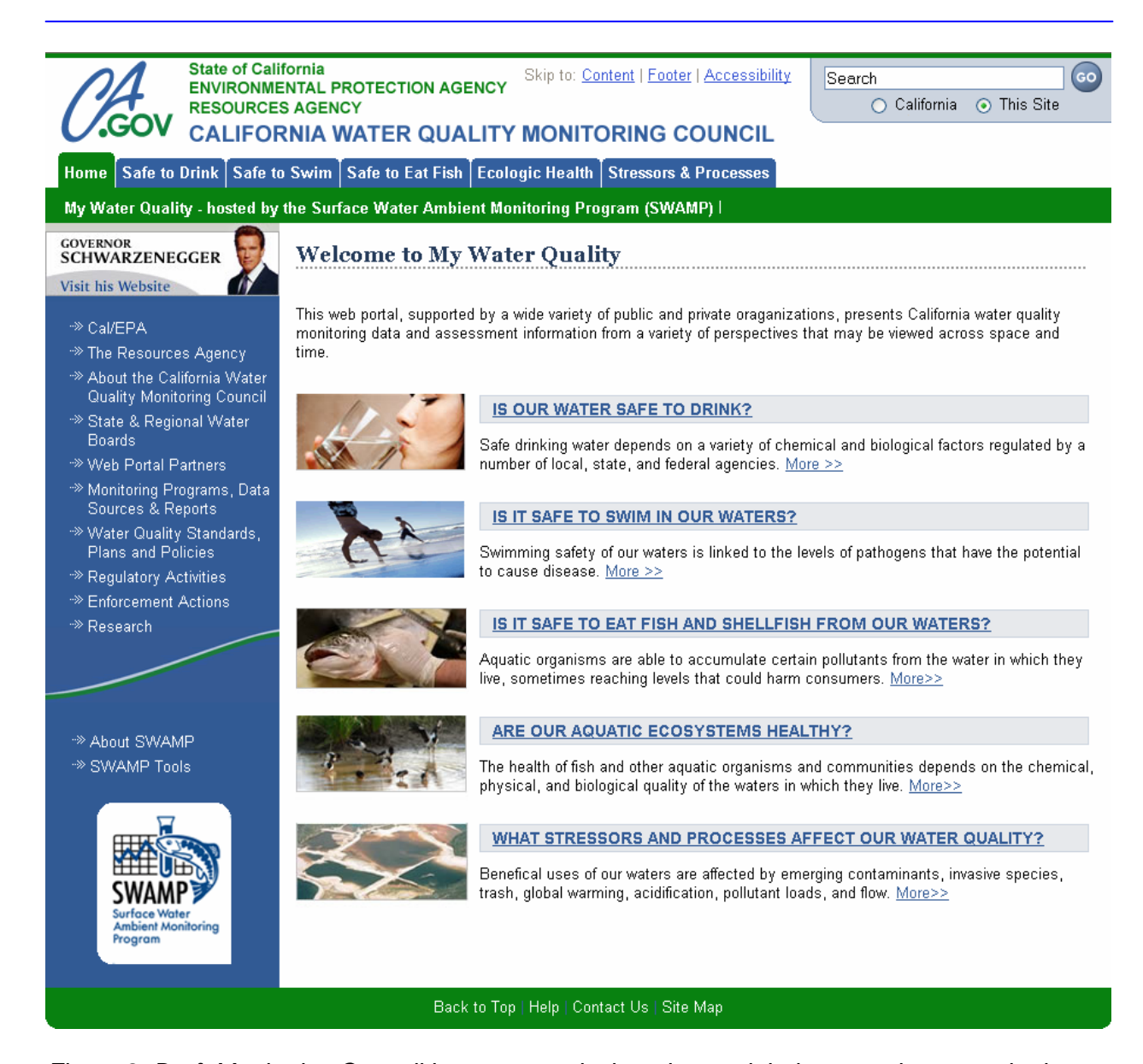
Figure 2. Draft Monitoring Council home page, designed as a global entry point to monitoring and assessment information for all theme and sub-theme web portals.

Each question will lead to a series of web pages for each theme (see Figure 3 for the draft page for swimming safety) that provide map-based access to summary assessment products and more detailed monitoring data, as well as tools for downloading data and conducting ad hoc queries and analyses. Links along the left-hand side of each page will enable users to access management, regulatory, and technical information specific to each theme. In the draft swimming safety portal (Figure 3), additional pages addressing more detailed questions link to